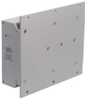
M2 mounting plate option