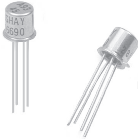
Product may not be to scale

The four pin TO-18 package is the smallest available in the miniature hermetically sealed series of networks. It should be the first choice for simple networks requiring multiple R's. This network can contain up to 5, V5X5 resistor chips. Note that case grounding limits the circuit options to a two resistor divider. Review data sheet "7 Technical Reasons to Specify Bulk Metal ® Foil Resistor Networks."