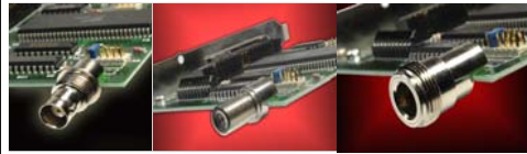
Patented V-Bite®, Snaps Into PCB, Surface Mount Center Contact