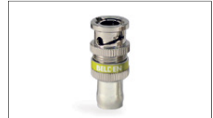
179DTBHD1 179 Digital Truck BNC with Locking Connector

Traditional pin, collar and connector approach, but designed specifically for Belden cable tolerances for better performance and durability. Compatible with select competitive crimp tools and die sets.