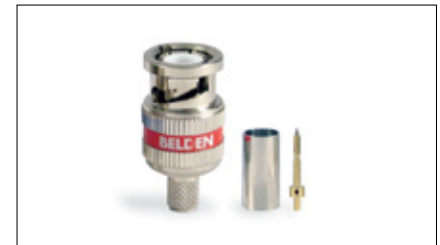
1505ABHD3 RG59 BNC HD Connector