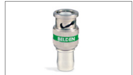
1695ABHD1 RG6 Plenum Size 2 BNC HD Connector