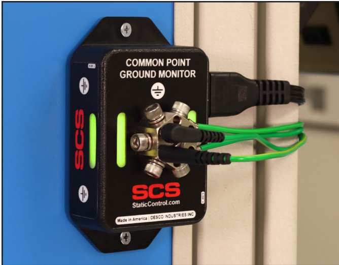
Figure 4. Using the Common Point Ground Monitor

Use the banana jacks on the ground hub to connect banana plugs to ground. Use the 6 included socket head screws and split washers to secure ground wires with ring terminals.