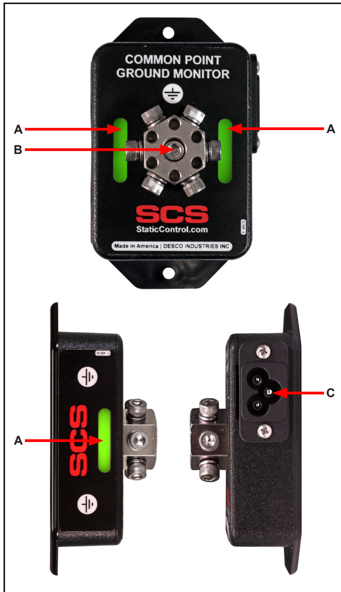
Figure 2. Common Point Ground Monitor features and components

A. Status LEDs: Illuminates green when the AC outlet is properly wired and its path to equipment ground via the equipment ground conductor is intact. Illuminates red and audible alarm sounds when the AC outlet is not properly wired and its path to equipment ground via the equipment ground conductor is broken.