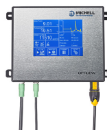
Optidew 501 Chilled Mirror Hygrometer