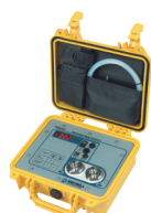
MDM50 Portable Hygrometer