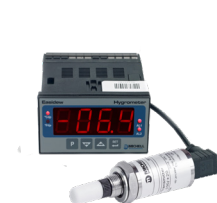
Easidew Online Dew-Point Hygrometer