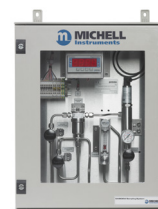
ES20 Compact Sampling System

Michell Instruments Ltd , Rotronic Instruments Corp. 135 Engineers Road, Suite 150, Hauppauge NY 11788 Tel: 631 427 3898, Email: us.info@michell.com , Web: www.michell.com/us